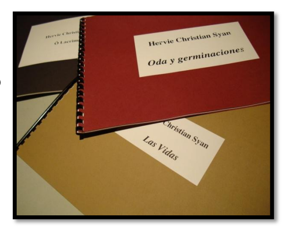
Scores - Oda y germinaciones (1996), Las Vidas (1996) and Ô Lacrimosa (1995)