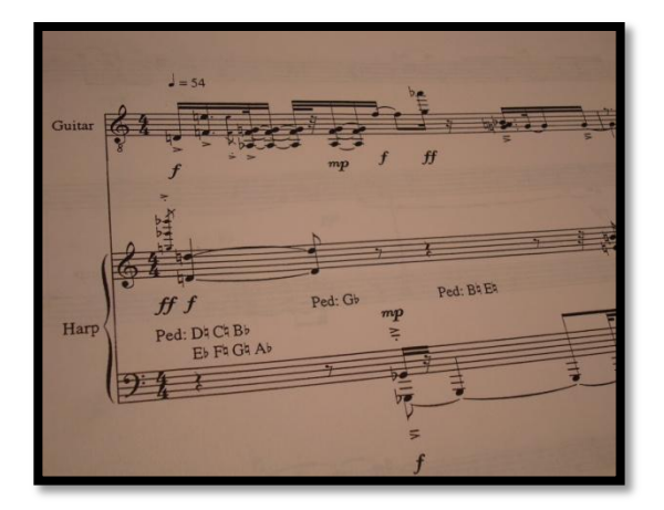
Opening of Las Vidas (1996)